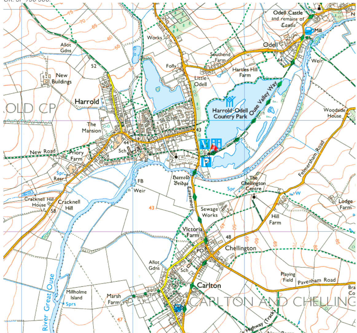
OS Map for Harrold Odell Country Park

Finish location, postcode and grid reference (18 Apr)