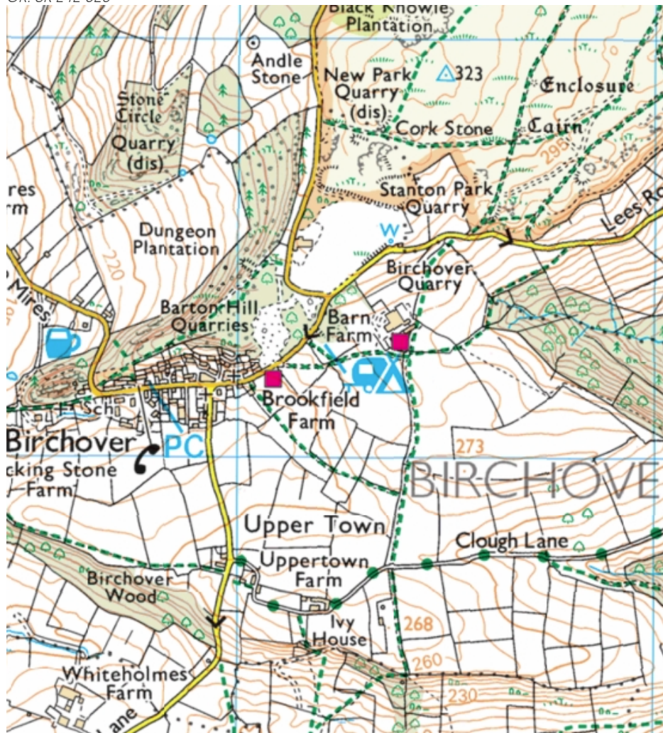
OS Map for Barn Farm