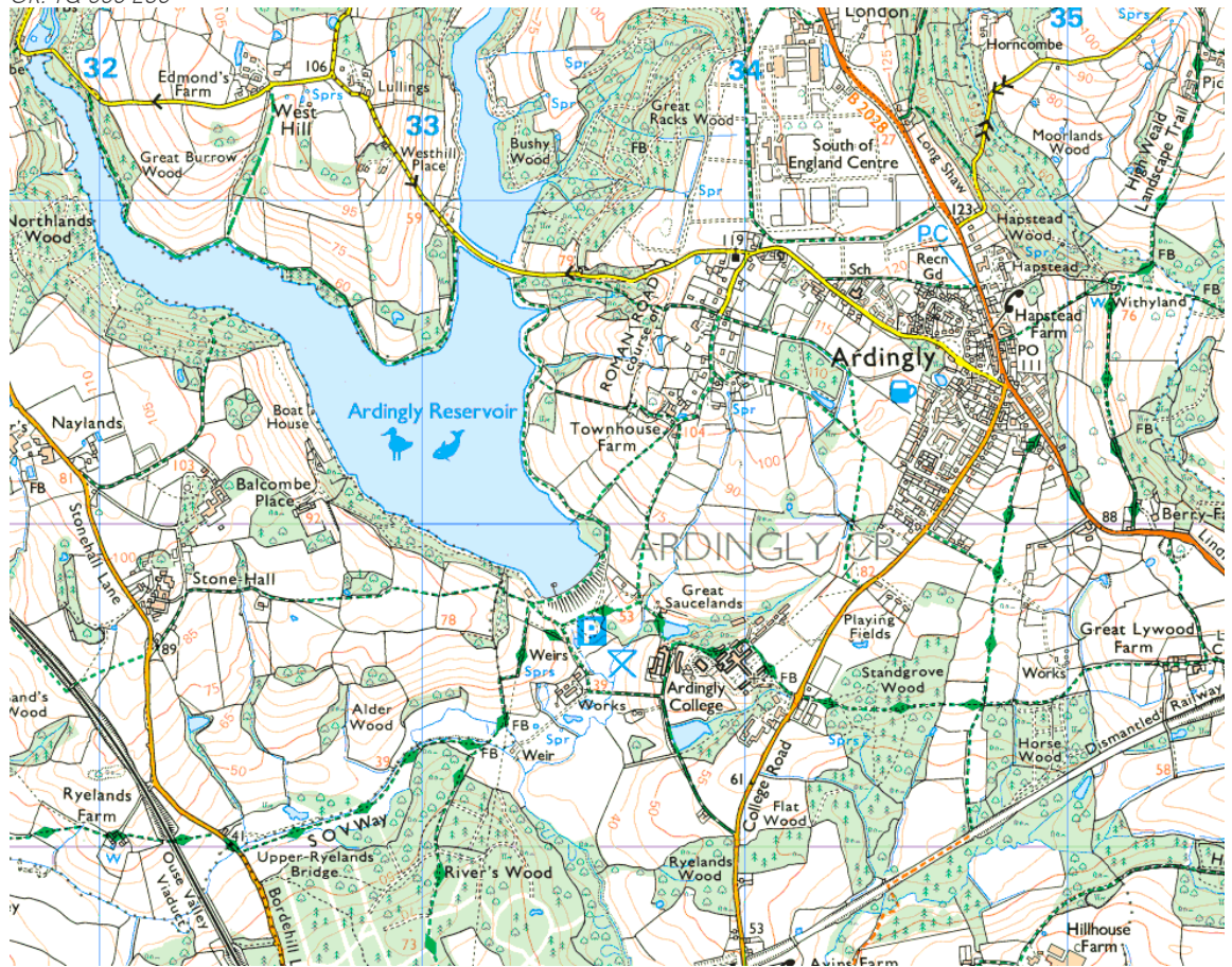
OS Map for Ardingly Reservoir Car Park

Finish location, postcode and grid reference (11 May)